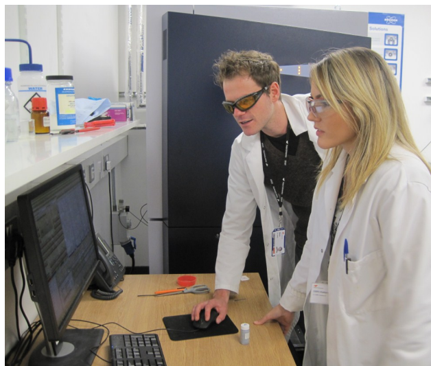
Figure 3: Processing the in-situ syngas high pressure XRD data.

Tony Bridgwater Aston University E: a.v.bridgwater@aston.ac.uk W: www.aston.ac.uk/ebri